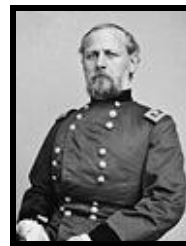
Maj/Gen Don Carlos Buell, USA

Considering the casualties for the engaged strengths of the armies[2], the Battle of Perryville was one of the bloodiest battles of the Civil War, and the largest battle fought in the state of Kentucky.