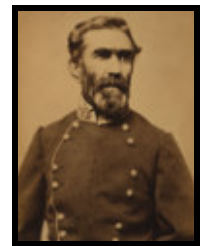
General Braxton Bragg, CSA