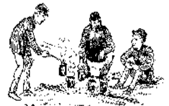
LINE CAMP-FIRE BEFORE THE GREAT ATTACKS

Since the cook had been sent out to purchase goods I did the cooking for the mess. He returned at night with a few articles which cost at the following rates: Onions $2 per dozen; butter $3 per pound; chickens $3 each; pork $1 per pound; also some eggs at $3 per dozen to make some eggnog for Christmas. Today I wrote a lengthy letter to my wife, but the person I had intended to carry it had gone. This was a disappointment.